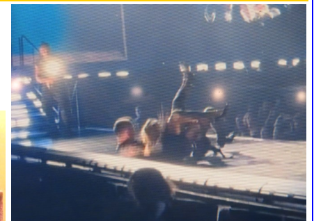
Madonna on her keyster in Seattle