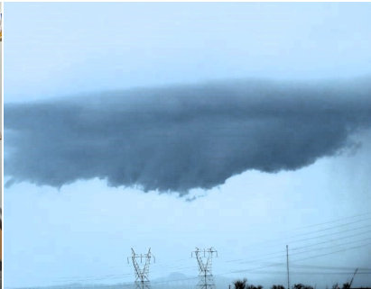
Dark, Heavy Clouds over our meeting