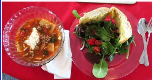
Lasagna Soup, Spinach Salad, Garlic Bread